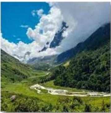
Har ki Dun Valley