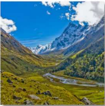
High altitude meadows

Experience the oldest trek route of the Himalayas and witness the Beautiful ancient culture, mountain views, forests, grasslands, meadows, rivers, streams and even an alpine lake.