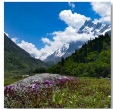
Flora & Fauna