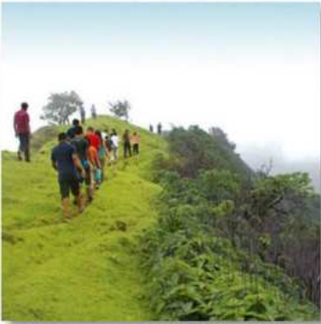
Flora & Fauna