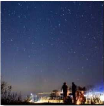
Majestic Night Sky View