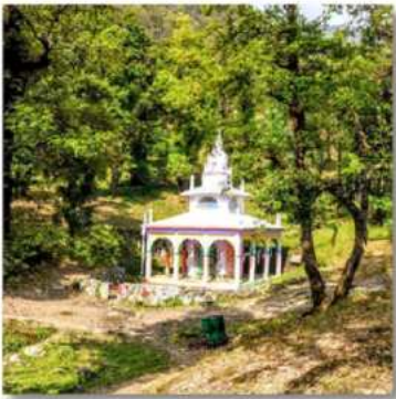
Nag Tibba Temple